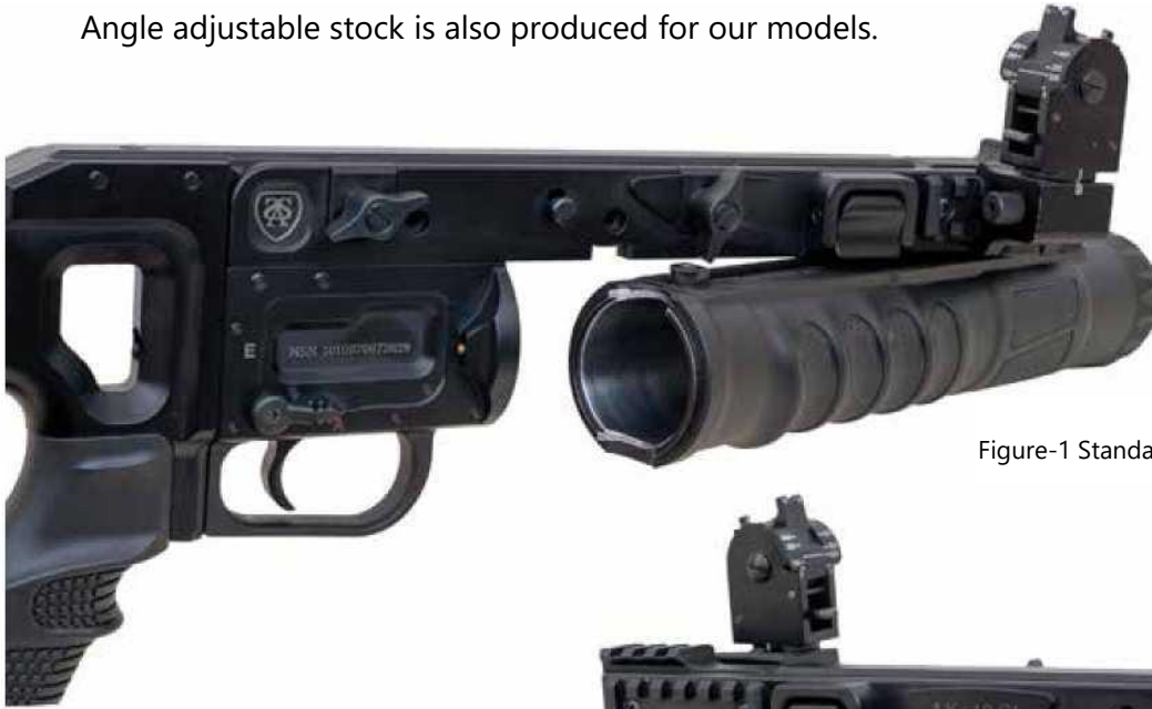
Figure-1 Standalone (Loading on the right side)

Angle adjustable stock is also produced for our models.