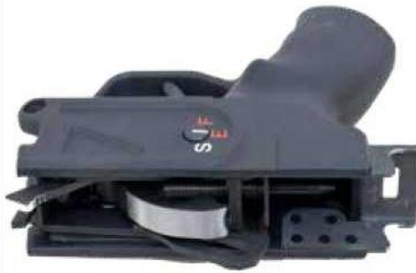
MP-5 Trigger Assembly