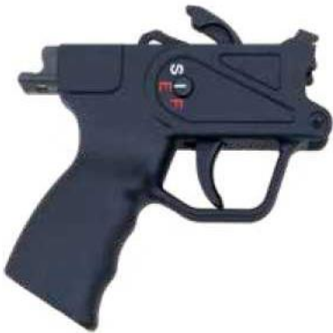
MP-5 Trigger Assembly