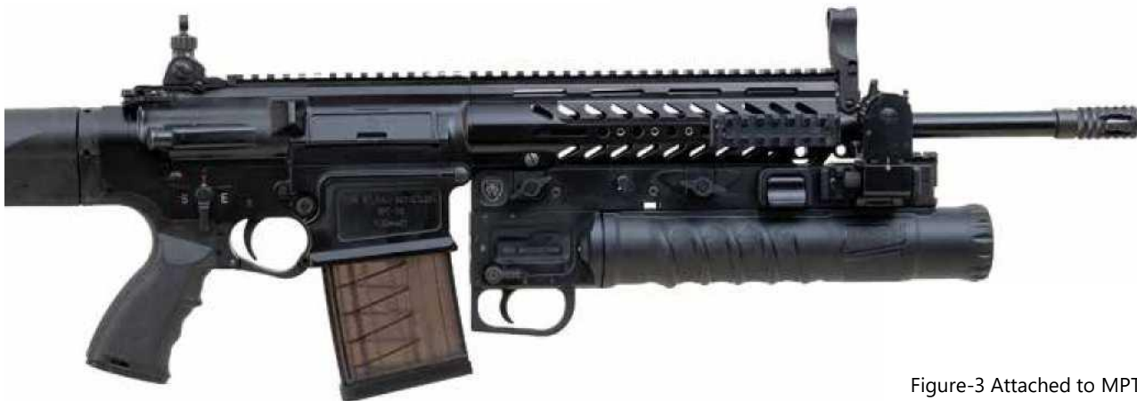
Figure-3 Attached to MPT-76 Infantry Rifle