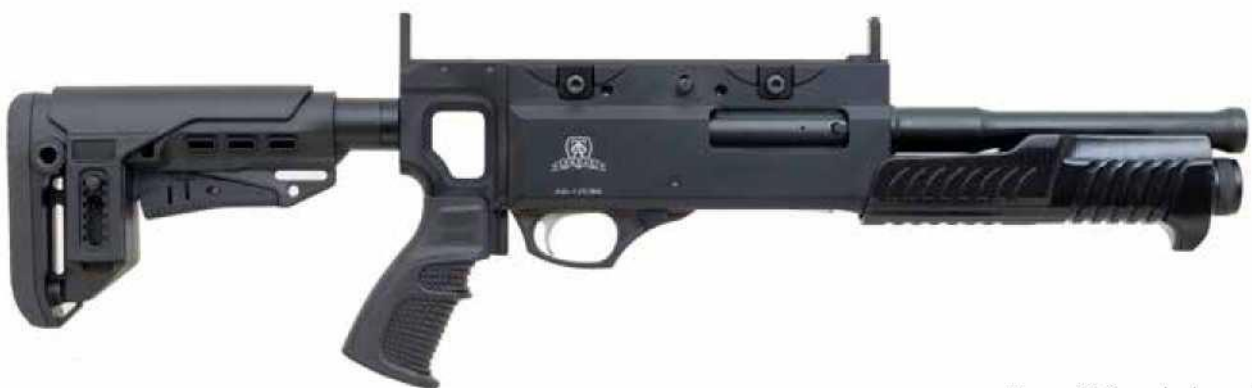
Figure-2 Stand-alone form