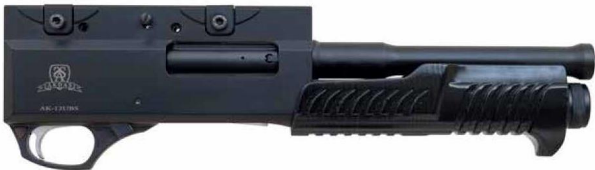
Figure-1 Form to be attached to infantry rifles

This UBS can shoot both lethal (steel or lead pellets) or non-lethal (rubber) ammunition and is quite effective for riot control and close combats as the shotshells that it fires will spread and hit a wide area.