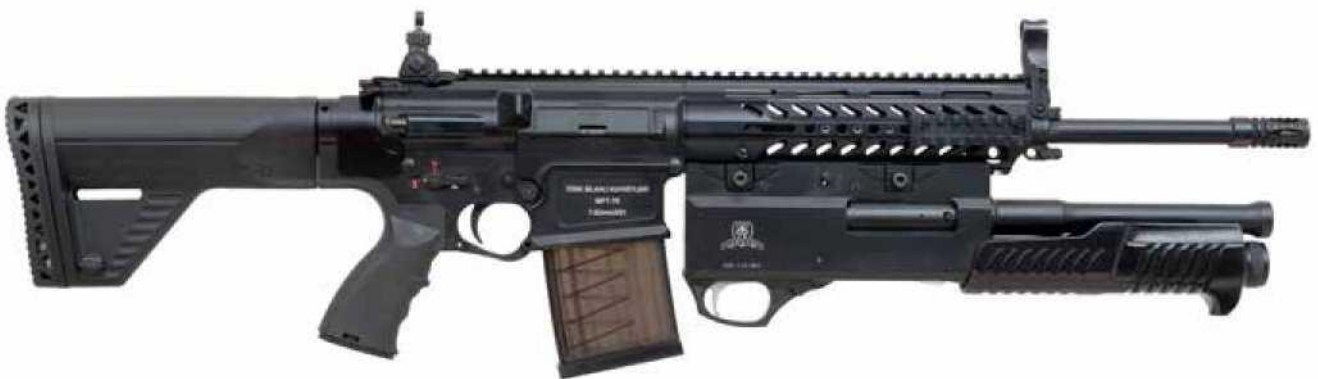
Figure-4 Attached to MPT-76 infantry rifle