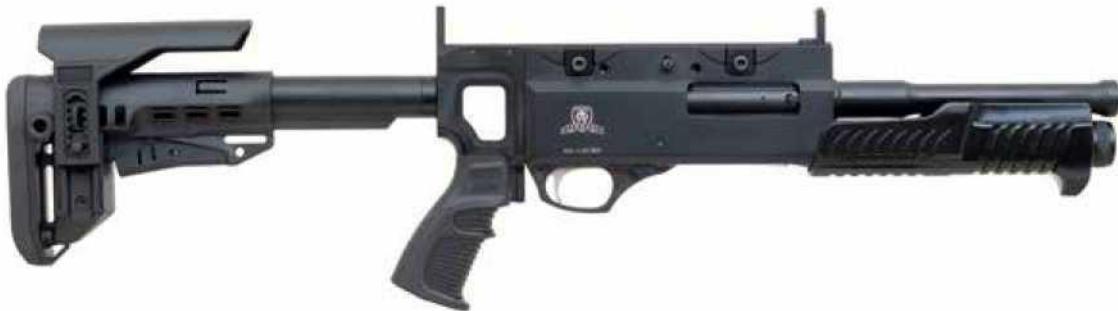
Figure-3 Stand-alone form (telescopic stock wide open and adjustable comb high)