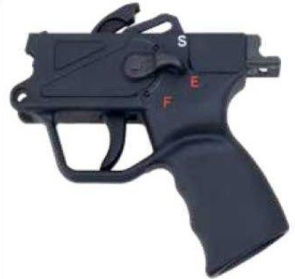
MP-5 Trigger Assembly