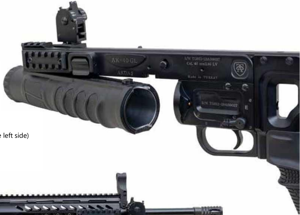
Figure-2 Standalone (Loading on the left side)