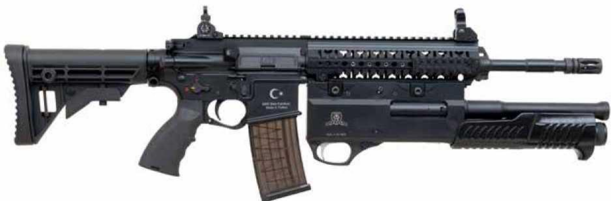
Figure-5 Attached to MPT-55 infantry rifle